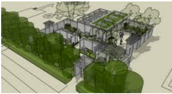
Overhead view of the Bonsai and Penjing Garden